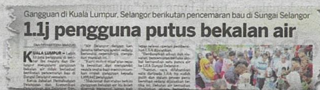
KERATAN Kosmo! 20 Julai 2019.