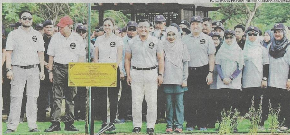
Sultan Sharafuddin dan Tengku Permaisuri Norashikin berkenan menyempurnakan program Tanam Pokok Dalam Bandar di Cyberjaya semalam.