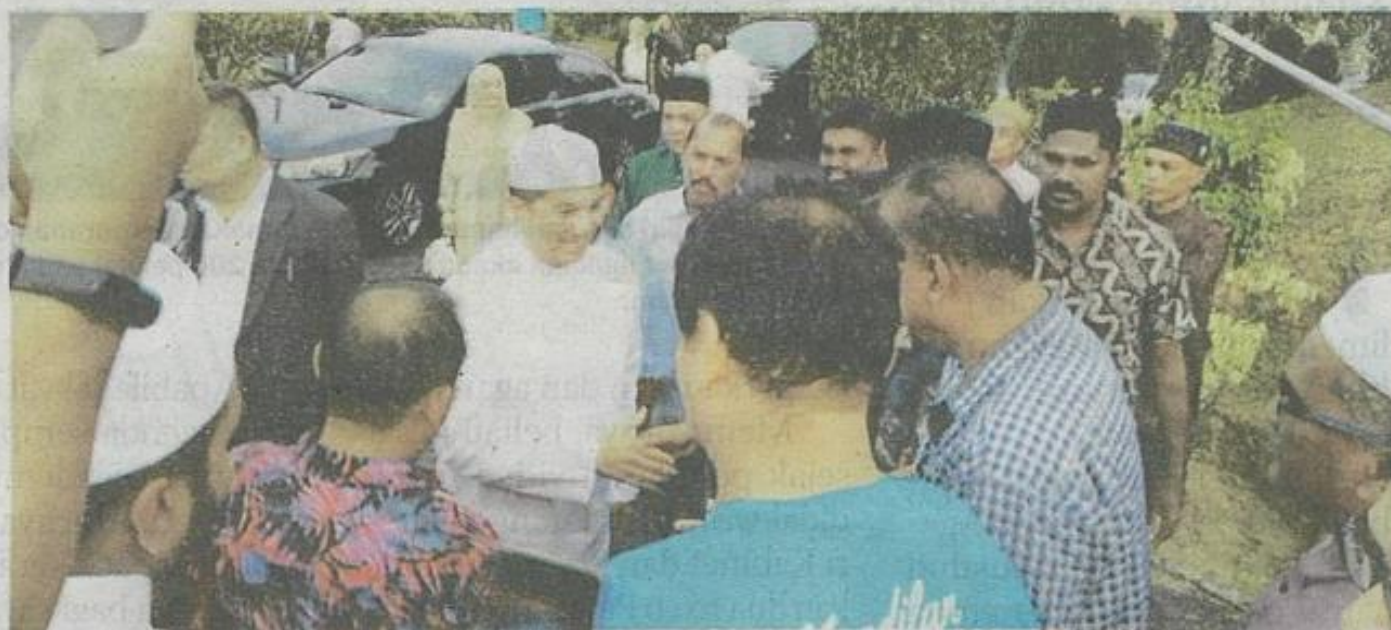
Azmin bersalaman dengan tetamu yang hadir pada majlis doa selamat dan kesyukuran di kediaman Menteri Besar Selangor di Shah Alam semalam.

Pekarangan kediaman berkenaan turut dilengkapi khemah dan meja untuk jamuan selepas solat dan doa selamat.