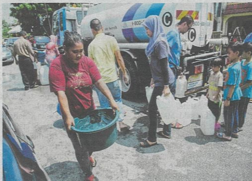
People queueing to collect water from an Air Selangor tanker in Ampang on Saturday.

Meanwhile, the National Water Service Commission (SPAN) will take legal action against the polluters over the unscheduled water disruption in the Klang Val-