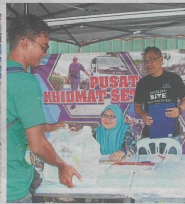
A resident receiving water at a local service centre.

water tanks that can store up to 5,000 litres of water.