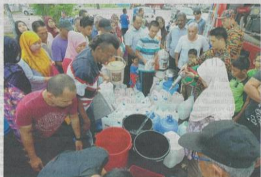
GANGGUAN bekalan air bukan sahaja menjejaskan kehidupan penduduk bahkan menjejaskan sektor pertanian.