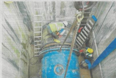
KEBAJAJAN dan agensi berkaitan perlantikan jalan untuk menanggarkan gangguan bekalan air khususnya di Selangor dan Lembah Klang.

Maklumat mengenai perkembangan gangguan bekalan air boleh diperolehi dengan melayari laman-sesawang www.syb.com.my atau Whatsapp ke 019-281 6793.