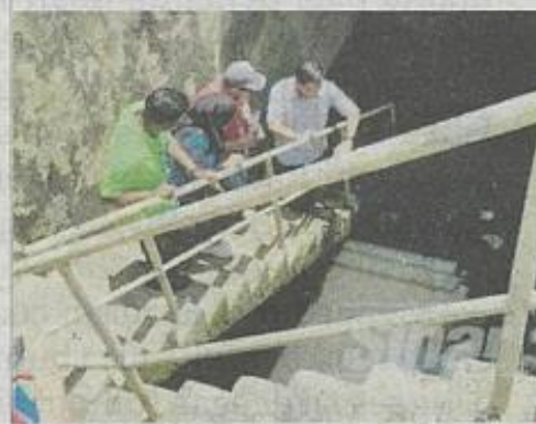
Laporan Sinar Harian semalam.

“Bagi mengelak sebarang gangguan kepada kualiti efluen, pengasingan telah segera dibuat untuk mengawal pelepasan efluen terakhirnya ke Sungai Liam,” katanya dalam satu kenyataan semalam.