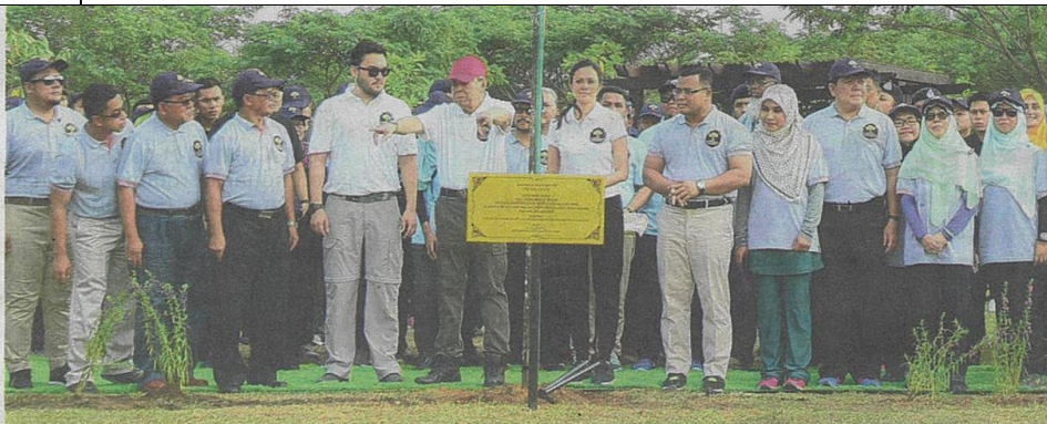
SULTAN SHARAFUDDIN IDRIS SHAH dan Tengku Permaisuri Norashikin serta Tengku Amir Shah berkenan menghadiri program Tanam Pokok Dalam Bandar Negeri Selangor di Cyberjaya, Selangor semalam.