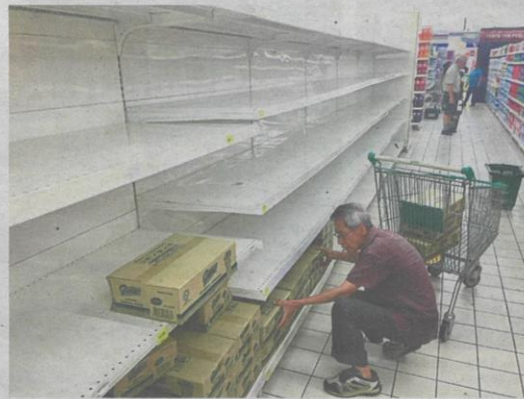
Many supermarkets ran out of mineral water because of water disruption concerns.

Free water distributed at local service centres in Klang Valley