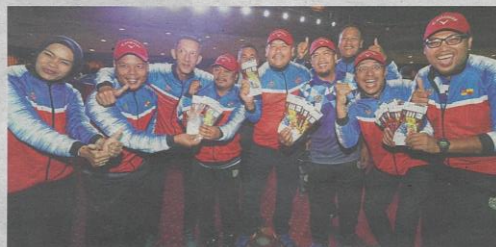
MBSA employees showing off their Sultan of Selangor's Cup 2019 tickets.

(Below) Some 5,000 spectators from Ampang Jaya are expected to attend.