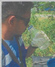
Nosing around: A Syabas officer collecting a water sample from Sungai Batang Kali.

Syarikat Bekalan Air Selangor Sdn Bhd (Syabas) – a member of Air Selangor group – announced that